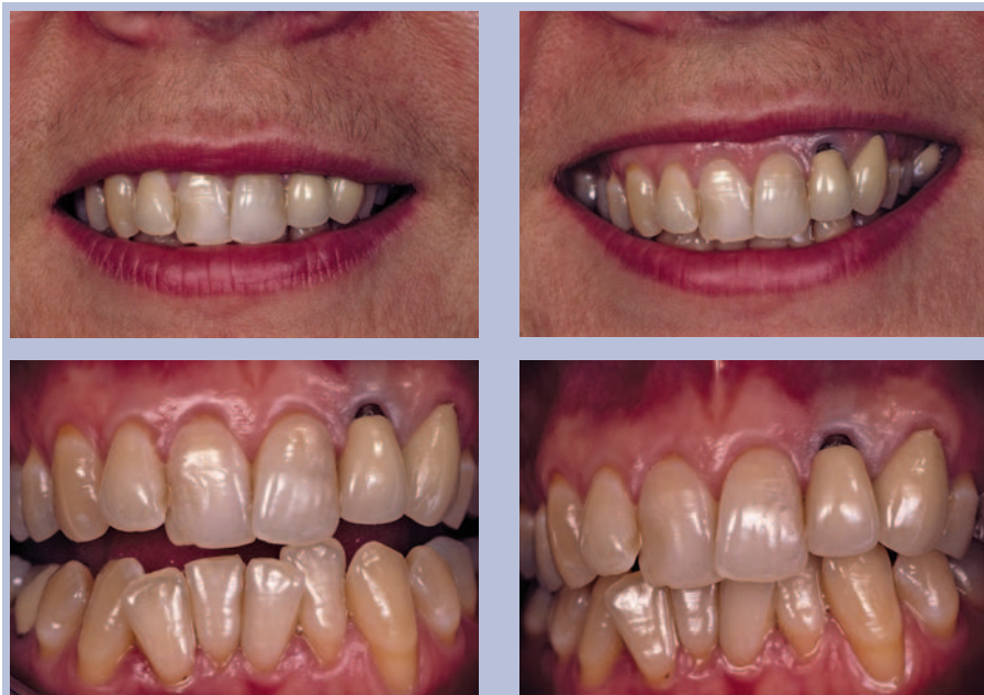
Fig. 4 A set of pre-operative images is ideal for examination, diagnosis and treatment planning