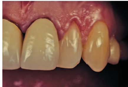
Fig. 9 Inflamed free gingival margins around defective crowns on central incisors

Most patients are not dentally knowledgeable and will benefit from explanations of various dental diseases, their aetiology, prevention and amelioration. A verbal explanation alone may be confusing or even daunting for a non-professional, but when a pictorial representation is included it can be elucidating and has a lasting impact. For example, many individuals suffer from some form of periodontal disease and showing pictures ranging from mild gingivitis to refractory periodontitis leaves an ever-lasting impression, informing the patient of the potential hazards of this insidious disease (Figs 11-15). In addition, most patients are oblivious to advances in dental care, for example all-ceramic life-like crowns or implants to replace missing teeth. Once again, a