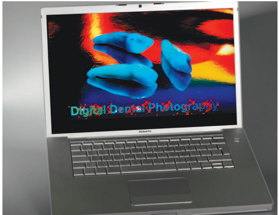
Fig. 19 Dental photography is an integral part of academic teaching

Beyond patient and staff education, photography is an integral part of lecturing for those wishing to pursue the path of academia (Fig. 19). In addition, if a clinician desires to publish post-graduate books or articles, either now or in the future, meticulous photographic documentation is a must. There are innumerable publications ranging from high-level academia to anecdotal dental journal. Whichever appeals to an