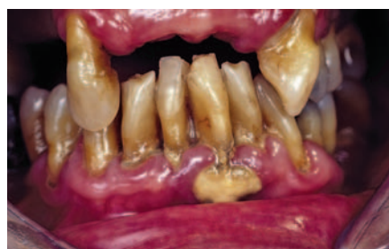
Fig. 15 Hopeless prognosis due to periodontal destruction caused by calculus build-up