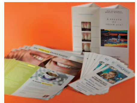
Fig. 26 Practice brochures and newsletters with clinical images

However, to construct a web page with an impressive design layout with slick transitions and music requires employing a professional web designer. In addition, the web page designer can advise on the best methods for obtaining hits for the site, plus a host of additional features (eg links) that ensures the investment is productive. Although the initial cost may seem excessive, it is well worth investing in this form of advertising as it is without doubt the future, and the capital outlay can be readily recouped within a short period of time by referrals and/or new patients.