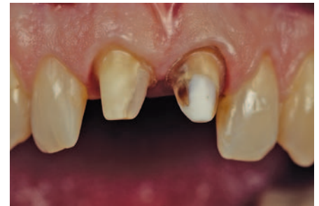
Fig. 10 Healthy free gingival margins after a week of temporisation with acrylic crowns