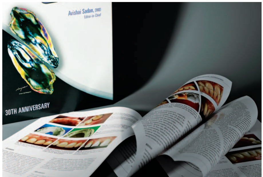
Fig. 20 Articles in a dental journal add kudos to a practice

individual is a personal choice, but having a practice or dentist profiled or published in the dental literature adds kudos to a practice (Fig. 20). Also, local newspaper features are reassuring for existing patients and promote the surgery to potential new clients.