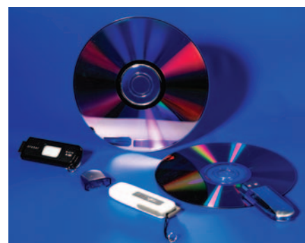
Fig. 3 Numerous media are available to store images, eg CD, DVD or flash drives