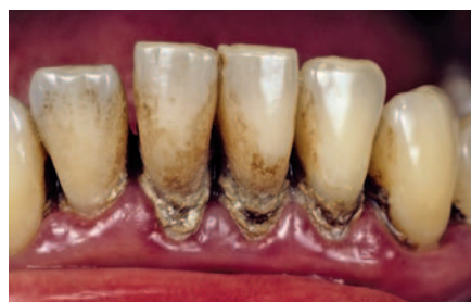
Fig. 13 Gross calculus build-up in a patient whose first dental visit was at the age of 40