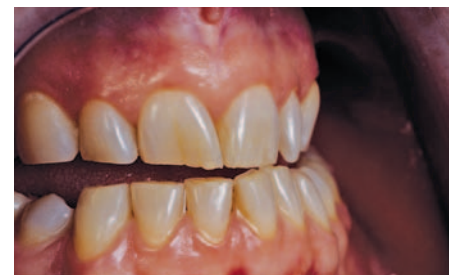
Fig. 6 Tooth wear requiring replacement of lost enamel and dentine