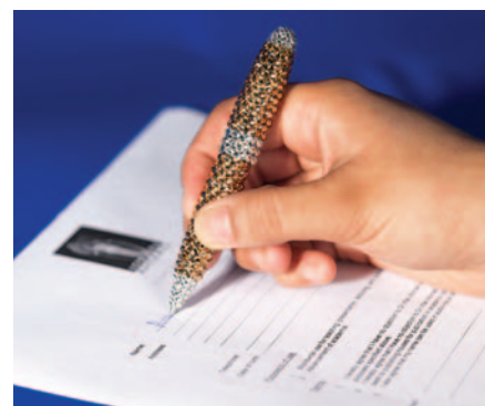
Fig. 1 It is imperative to ask patients to sign a copyright release form before taking pictures

confidentiality. Unless the patient has unusual or defining features such as diastemae, rotations etc, it is difficult for a layman to identify an individual by most intra-oral images, and hence confidentiality is rarely compromised. However, extra-oral images, especially full facial shots, can and do compromise confidentiality and unless prior permission is sought, these types of images should not be undertaken. This is also applicable for dento-facial images that include the teeth, lips and smiles, which are often unique and reveal the identity of patients. A standard release form stating the intended use of the pictures can readily be drawn up, and when signed by the patient, should be retained in the dental records (Fig. 1). A crucial point worth remembering is clearly stating the 'intended use' of the images. While most patients will not object to dental documentation for the purpose of recording pathology and treatment progress, they may be more reticent if their images are used for marketing, such as on practice brochures or newsletters for distribution by a mailshot.