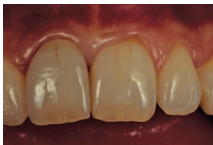
Fig. 21 The crown on the right central incisor has a lower value compared to the natural left central incisor