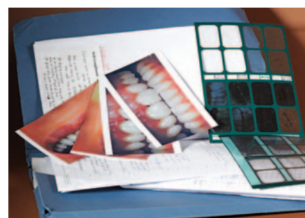
Fig. 2 Dental images, similarly to radiographs, become part of the patient's dental records