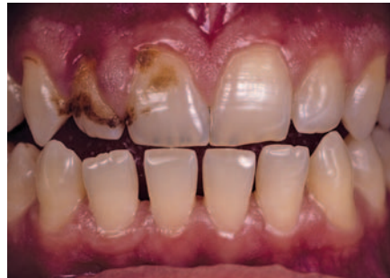
Fig. 11 The benefits of scaling and polishing for the teeth and gingivae are clearly evident in this image