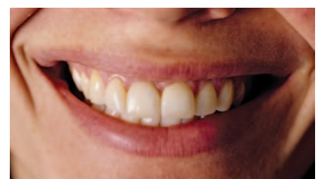
Fig. 18 Post-operative: ceramic implant-supported crown to replace missing right central incisor