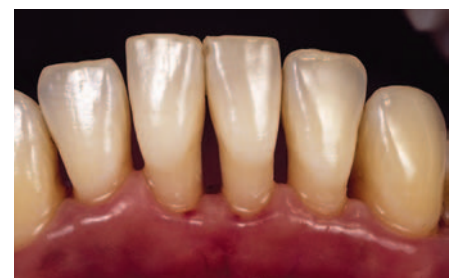
Fig. 14 The patient in Figure 13 after scaling and polishing teeth