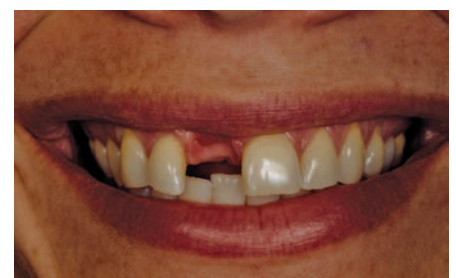
Fig. 16 Pre-operative: missing right central incisor