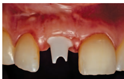
Fig. 17 Zirconia abutment screwed onto implant