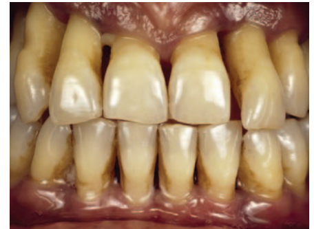
Fig. 12 Refractory periodontitis in a diabetic patient