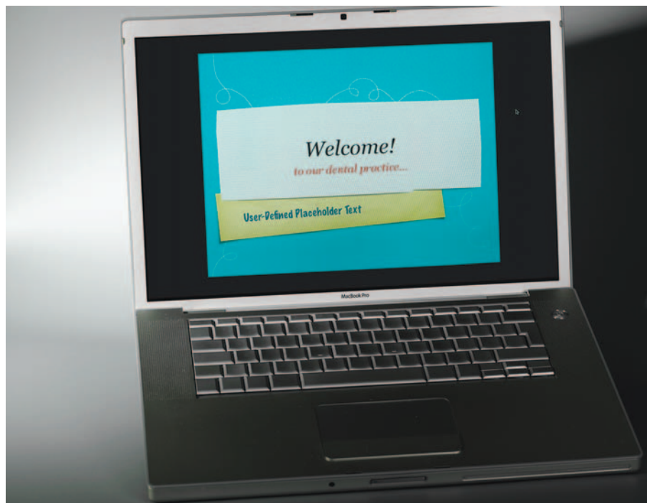
Fig. 23 An automated computer presentation is an excellent internal marketing tool

if patients' wishes are not effectively conveyed to the ceramicist, who after all is making the prostheses, disappointment is inevitable. The best way to mitigate this eventuality is by forwarding images of all stages of treatment to the ceramicist, together with the patients' expectations and wishes. Photographs can be traced, or marked with indelible pens to communicate salient features such as shape, alignment, characterisations, regions of translucency or defining features such as mamelons, banding, calcification, etc. Also, taking pictures at the try-in stage allows the ceramicist to visualise the prosthesis in situ in relation to soft tissues and neighbouring teeth, as well as to the lips and face. At this stage, alterations can change the shape, colour, alignment, etc, before fitting the restoration (Fig. 21), which obviously avoids the post-operative dissatisfaction that can be embarrassing, frustrating and costly if a remake is the only reparative option.