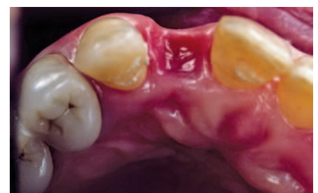
Fig. 8 Assessing ridge morphology prior to treatment planning for implants

devices (Fig. 3). While this plethora of methods allows flexibility and convenience, it also demands added responsibility for ensuring that discs or memory cards do not go astray. Each medium has its advantages and limitations. A printed photograph is ideal for educating patients about a specific treatment modality, or for showing the current state of their dentition and subsequent improvement after therapy. However, prints are not a good method for archiving. On the other hand, electronic storage is preferred for permanent archiving and retrieval as it is environmentally friendlier, but is more cumbersome and not readily available to hand compared to prints. The chosen medium is a personal preference and varies for each practice. Fully computerised surgeries may opt to store patients' images with their dental treatment details, while paper-based surgeries may prefer photographic prints for easier access.