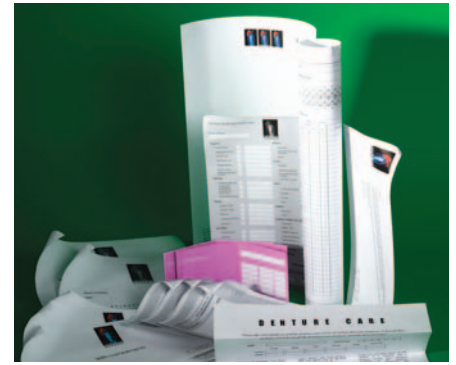
Fig. 24 A selection of practice stationery that can benefit by incorporating dental imagery

If one is computer literate, it is relatively easy to design an in-house web page, using images similar to that on the practice brochure or newsletter.