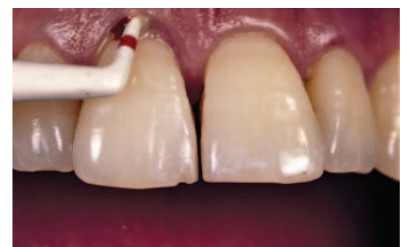
Fig. 7 Periodontal pocketing