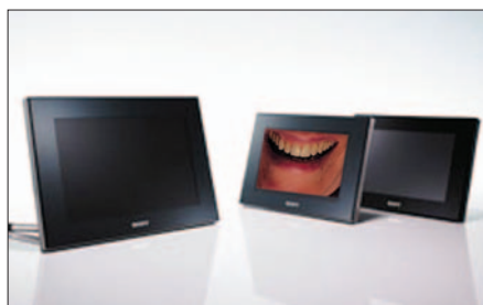
Fig. 22 Digital picture frames